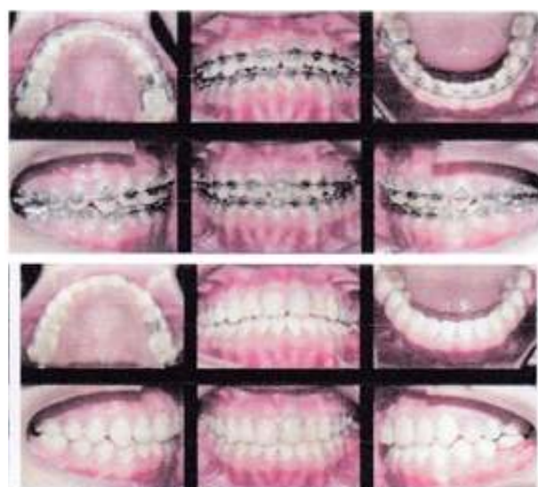
Fig 9. The patient's occlusion condition just before bracket removal (left) and the patient's occlusion condition after bracket removal (right). (private collection documentation). Also seen here that the space is closed properly, the overjet and overbite have also been corrected as well.

Post-treatment can be seen in Figure 9, the patient has an occlusion with a class I molar and canine relationship. Overjet and overbite are also corrected. The second permanent molar is allowed to move mesially to close part of the space produced by the extraction of the mandibular first permanent molar. This treatment produced a noticeable change in the facial profile (figure 10a). Post-treatment lateral cephalogram analysis showed unchanged SNA and SNB values, as well as ANB values. The IRA-NA angle also did not change but this was not the case with the IRB-NB angle which has changed to 24^\circ from before treatment at 33^\circ . This means that overjet correction is mainly achieved by retraction of the anterior segment posteriorly and the former maxillary permanent molar tooth extraction space is utilized partly by the movement of the posterior segment to anterior and partly by the anterior segment to the posterior (moderate anchorage).