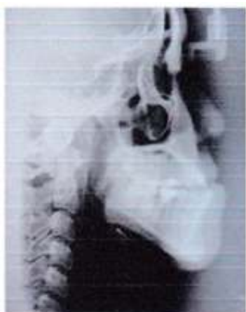
Fig 5. The patient's lateral cephalogram shows a hyperdivergent growth pattern with a Frankfort Mandibular angle of 35 ° (high angle).