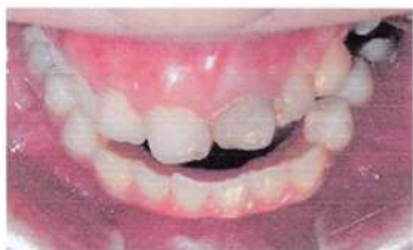
Fig 6. The patient has anterior and posterior cross bites (private collection documentation).

Panoramic roentgenogram of the patient showed the condition of the first molars that had been severely damaged with large restoration (garnbar 7). Both the second permanent molar and the third permanent molar have erupted in better condition than the first permanent molar.