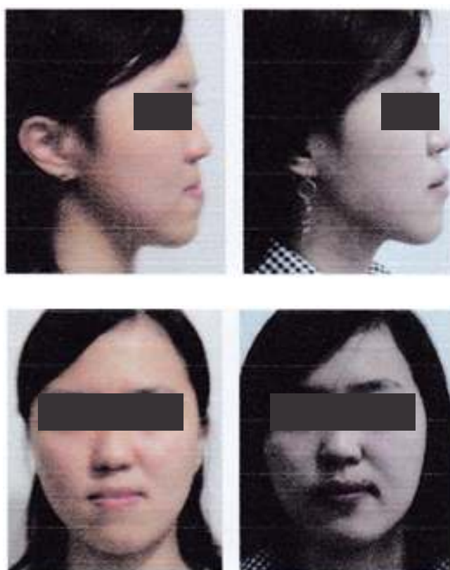
Fig 10.a) The patient's profile appears to change (left) before treatment and (right) after treatment. b) frontal view of the patient's face also shows changes (left) before treatment and (right) after treatment..