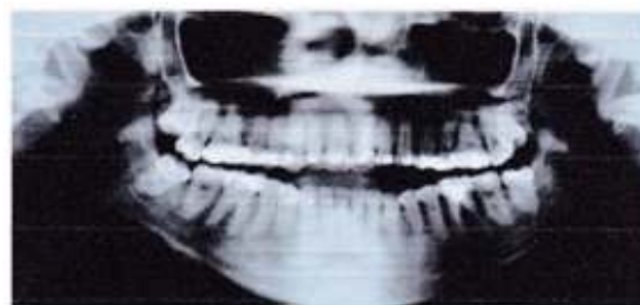
Fig 7. The patient panoramic shows the condition of posterior teeth which is not good - has a large restoration.

Panoramic roentgenogram of the patient showed the condition of the first molars that had been severely damaged with large restoration (garnbar 7). Both the second permanent molar and the third permanent molar have erupted in better condition than the first permanent molar.