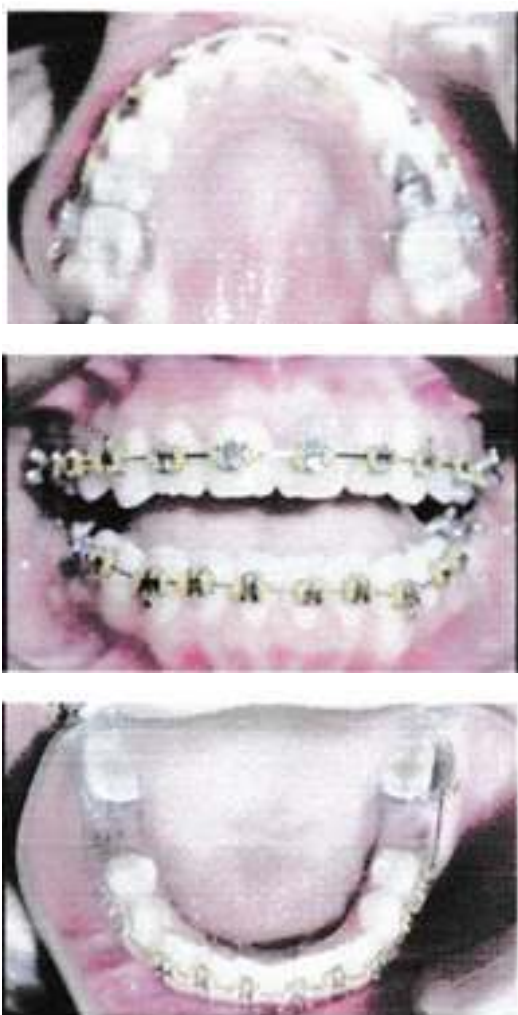
Fig 8. Treatment performed with fixed braces full arch accompanied by extraction of the mandibular first permanent molar.

Post-treatment can be seen in Figure 9, the patient has an occlusion with a class I molar and canine relationship. Overjet and overbite are also corrected. The second permanent molar is allowed to move mesially to close part of the space produced by the extraction of the mandibular first permanent molar. This treatment produced a noticeable change in the facial profile (figure 10a). Post-treatment lateral cephalogram analysis showed unchanged SNA and SNB values, as well as ANB values. The IRA-NA angle also did not change but this was not the case with the IRB-NB angle which has changed to 24^\circ from before treatment at 33^\circ . This means that overjet correction is mainly achieved by retraction of the anterior segment posteriorly and the former maxillary permanent molar tooth extraction space is utilized partly by the movement of the posterior segment to anterior and partly by the anterior segment to the posterior (moderate anchorage).