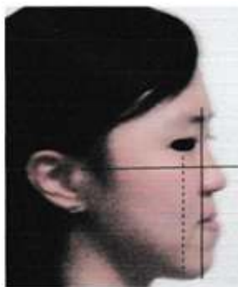
Fig 4. An ante-face pattern with characteristics of a relatively protrusive lower anterior face position or in front of a line perpendicular to the soft tissue nasionpoint..

namely sagittal or antero-posterior which are characterized by class III relations in molar and canine teeth, vertically marked by open bite and transversal which are marked by anterior and posterior cross bites.