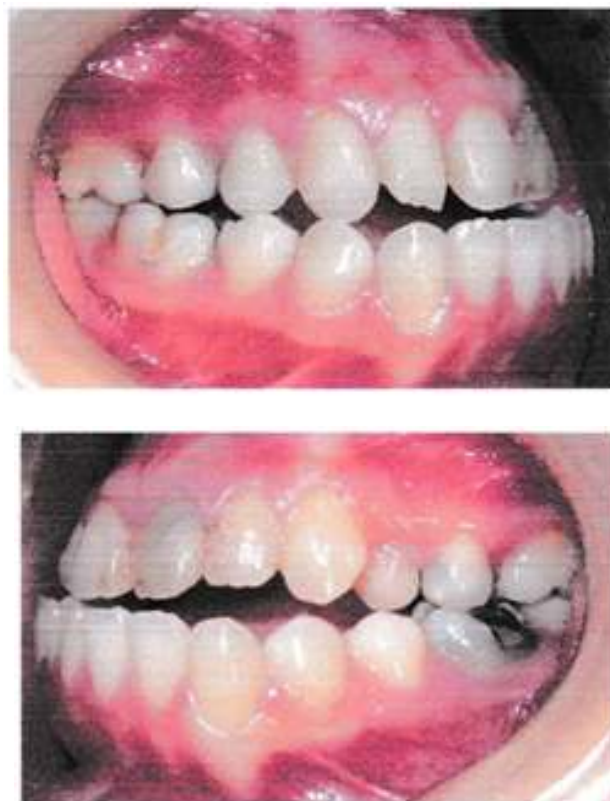
Fig 1. The pattern of molar relationships in Class III malocclusion, it appears that the mandibular first molars are more anterior than the maxillary first molars. (Documentation of private collections)

In addition to the maxillary position and the relation of the first permanent molar, class III malocclusion can also be assessed from its facial pattern. In this case, AM.Schwarz divides normal face profit into three categories. 1-3 The first category is a facial pattern called ante-face, which is facial profile characterized by the position of the lower anterior face which is relatively protrusive towards the perpendicular line of the soft tissue nasion point (figure 2a-c). The second category is the facial pattern called the mid-face with the characteristic position of the lower anterior face being approximately at the vertical/ perpendicular line of the soft tissue nasion point. The third category is the facial pattern called retro-face with the characteristic position of the lower anterior face behind the perpendicular line of the soft tissue nasion point.