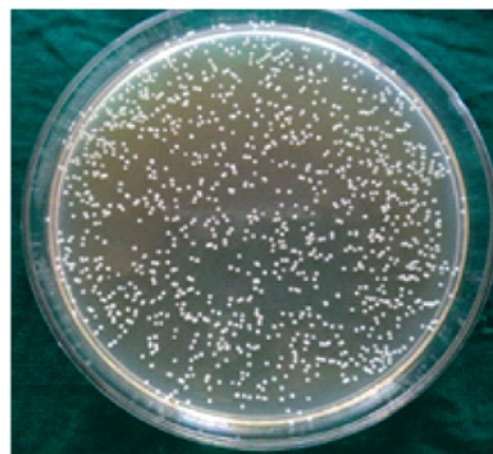
FIG. 2 - PLATE WITH CANDIDAL GROWTH